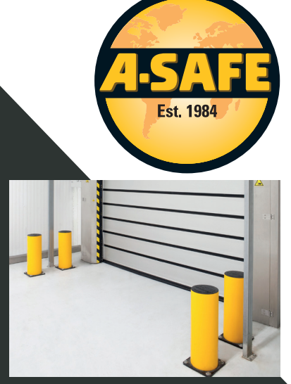
Double set of Bollards guarding expensive doors at a Zorbas Bakeries site in Cyprus

Find out more, contact sales +44 (0) 1422 331133, email sales@asafe.com or visit www.asafe.com