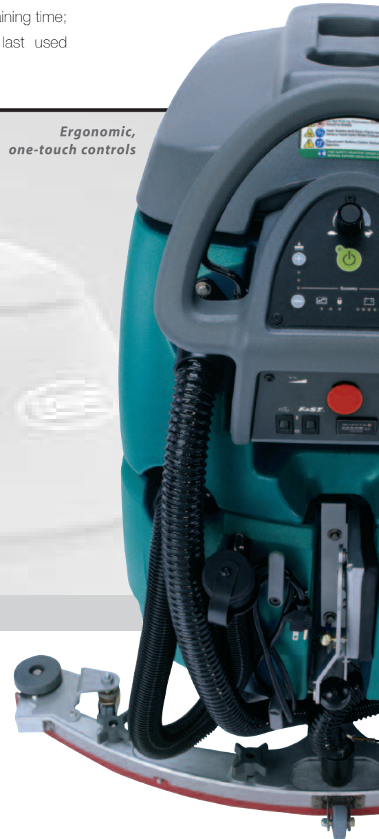
Ergonomic, one-touch controls