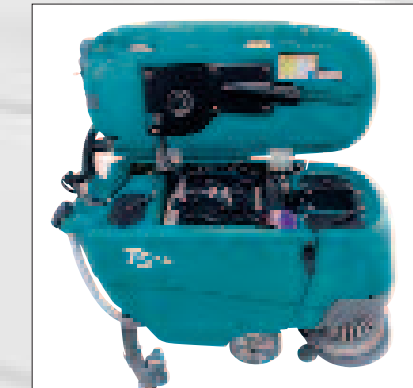
Longer lasting battery pack